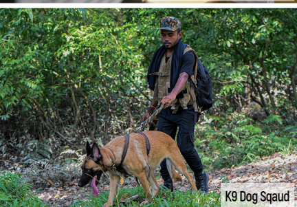
K9 Dog Squad