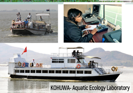
KOHUWA- Aquatic Ecology Laboratory