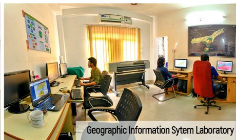
Geographic Information System Laboratory