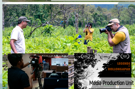
Media Production Unit