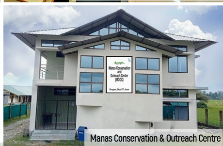
Manas Conservation & Outreach Centre