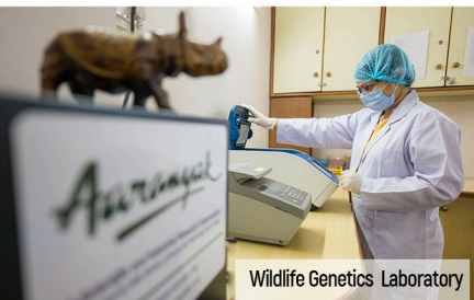
Wildlife Genetics Laboratory